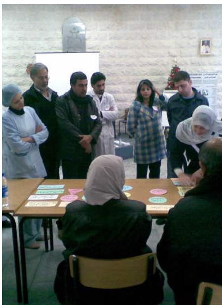
Private hospital training

To reach private providers in hospitals, PSP-Jordan launched a program entitled Preparing Private Hospitals to Manage GBV . PSP-Jordan contracted Institute for Family Health (IFH), a NGO that delivers comprehensive family health services since 1986, to help implement this new initiative.