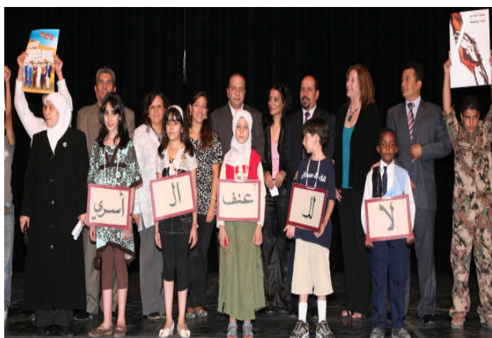
Family Guidance & Awareness Center at VAW launch.

Phase 2: Lozmilla Hospital, Marka Islamic Specialty Hospital, Al-Hamiadeh Hospital, Jordan Red Crescent Hospital, Al Mahabeh Hospital, Italian Hospital, King Abdulla University Hospital & Shmeisani hospital.