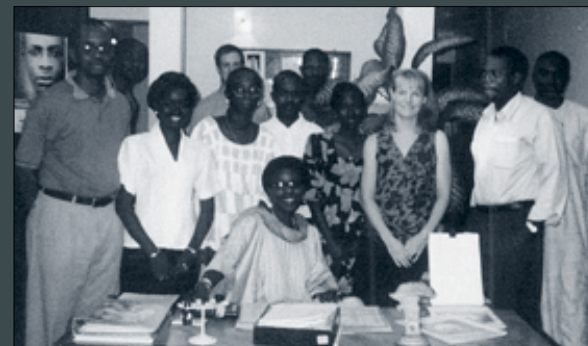
The ADEMAS office in Senegal

The CMS partner in Senegal is ADEMAS (an acronym from the French for Senegalese Association for the Development of Social Marketing). In order for ADEMAS to run efficiently and continue its dynamic social marketing programs, CMS conducted a two-week hands-on training program with their financial officers. Basic spread sheet analysis and accounting practices were incorporated into their standard operating procedures as a result of this assistance.