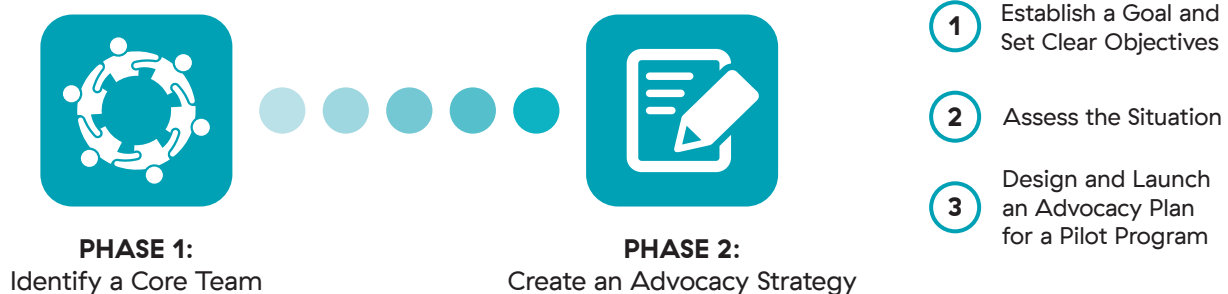
Figure 1. Advocacy plan development

SHOPS Plus supported APPOR using a participatory design process to develop a user-centered advocacy plan (Figure 1). SHOPS Plus and APPOR began by holding an advocacy plan development workshop for association members. The purpose of this workshop was to help members understand the requested policy change, confirm interest in expanding their scope of practice to include administration of injectable contraceptives, and secure their support. Using the SHOPS Plus Expanding Access to Injectable Contraceptives through Pharmacies toolkit, APPOR developed an advocacy plan that was responsive to Rwanda’s needs and opportunities, prioritized shared objectives, and outlined specific actions to meet them.