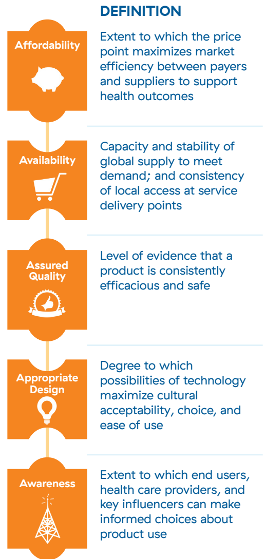
Figure 2. The five A's of market health