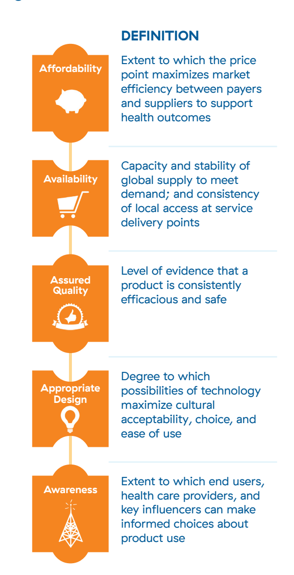
Figure 2. The five A's of market health