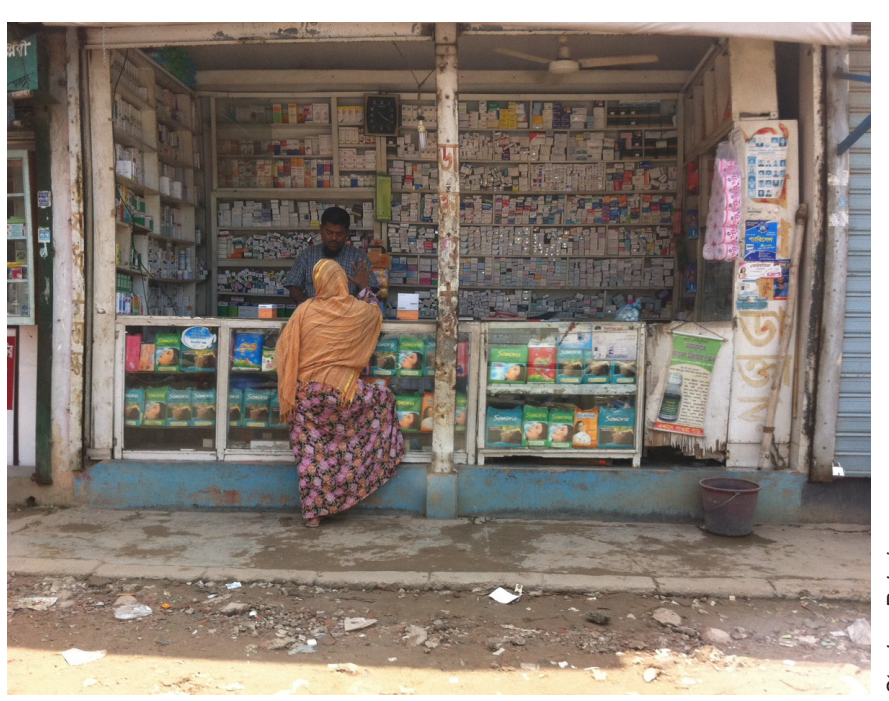
A woman visits a pharmacy in Bangladesh

Note: Numbers are rounded to the nearest one-tenth of a percent.