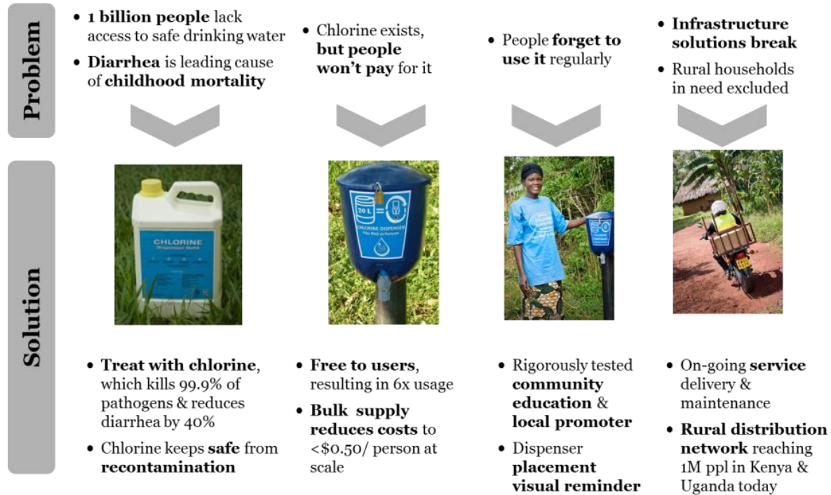
Figure 2: How dispensers achieve high adoption and sustainable service