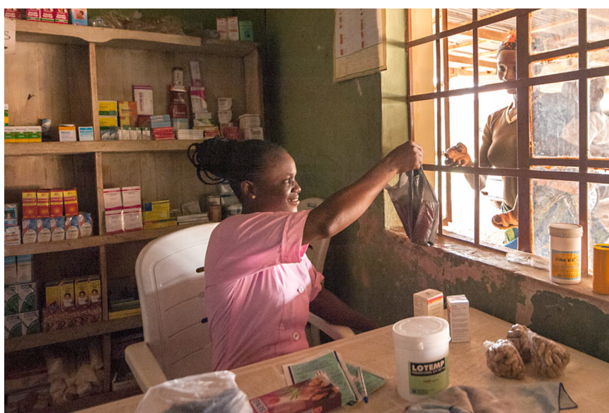
Partnership for Transforming Health Systems Phase II

In November and December 2012, we surveyed a sample of 40 managers of private facilities (including 14 that were providing ART at the time of the study). We collected information on their HIV service provision, interest in providing ART, capacity to provide it, and perceived barriers to its provision. A variety of facility types were selected across the five divisions of Lagos State. Table 1 shows the distribution of surveyed facilities by division and facility type. Ikeja and Lagos divisions are part of metropolitan Lagos, while Badagry, Epe, and Ikorodu are not part of metropolitan Lagos. We surveyed more facilities in those divisions with higher HIV prevalence. We asked managers for information at the facility level on staffing, services provided, patient volume, perceived barriers to ART provision, the capacity of their facilities to deliver ART services, and their interest in providing the treatment.