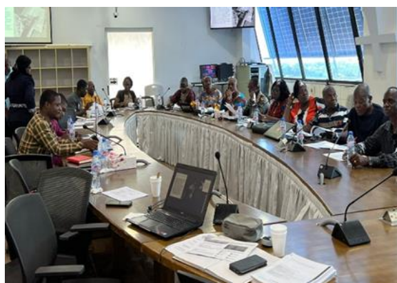
PARTICIPANTS GATHER FOR A GROUP PLENARY SESSION AT A PSE STRATEGY DISSEMINATION WORKSHOP IN MONTSERRADO.

Furthering the program's objectives, FHM Engage also supported the PSE TWG in developing its terms of reference and a PSE Action Plan, organized around four goals, which will be implemented in the coming year. These efforts correspond to the program's successful dissemination of the PSE Strategy in four counties (Bong, Margibi, Montserrado, and Nimba), in which county health teams and private sector representatives gathered to discuss the strategy and next steps forward, including the development of county-level TWGs. These sessions were co-hosted by the MOH/PSE Unit and HFL.