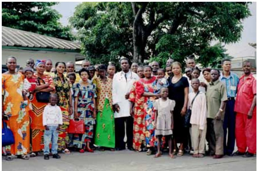
A doctor at the Heineken on-site clinic and a sampling of the many employees and dependents covered.

One common aim of several of the approaches is mitigation of the effects of HIV/AIDS on productivity. Indeed, Africa is at the epicenter of the global AIDS epidemic, and some of the models are intended to reverse the impact of HIV/AIDS. Yet, the target of each model may be recast to address several health challenges: TB, malaria, and unmet need for FP/RH services. In terms of next steps, the corporate models represent an excellent opportunity for MNCs, local enterprises, and the donor community to collaborate in developing sustainable models to increase access to health care and reduce health care costs while enhancing productivity.