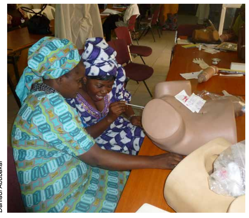
USAID/Nigeria supported training in the use of IUDs through the Strengthening Private Sector Family Planning and Reproductive Health project.

Increased knowledge about the effectiveness of RH/FP interventions will allow donors, policymakers, and program implementers to make informed decisions about resource allocation and programming, thereby strengthening the private sector's role in delivering RH/FP services in Nigeria.