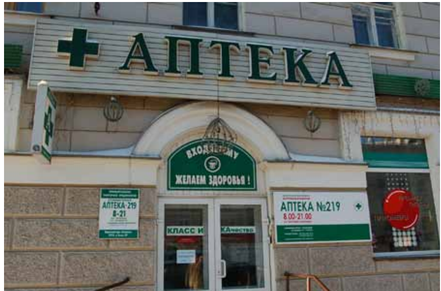
A municipal pharmacy in Yekaterinburg

Interviews with pharmacists indicated that the fastest-growing brands are third-generation pills such as Yaz, Yarina, and Diane 35, which are the most expensive. Pharmacy retailers actively market such brands to doctors. Mid-price products such as Marvelon, Regulon, Novynette, and Lindynette are market leaders among mid-income and younger women, though users are beginning to purchase newer formulations. Pills such as Microgynon and Rigevidon represent the lower end of the price spectrum.